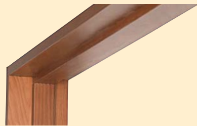
▪ Interior jamb with applied stop