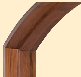
▪ Segmented arch jamb, non rated