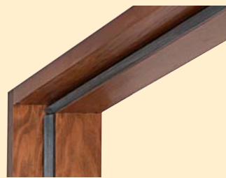
▪ Rabbeted jamb with weather stripping Available in 20 minute