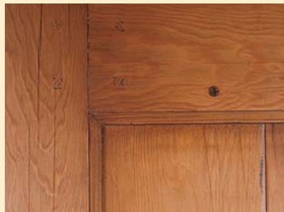
▪ Optional recessed square moulding ▪ Optional square pegs