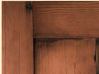
▪ Standard square sticking